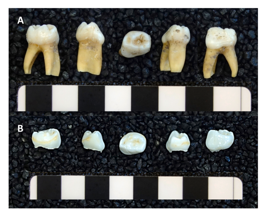
Fig. 1. A. Individual 4813, Brno-Vídeňská Street. Five surfaces of the 1st left mandibular deciduous molar; B. Individual 9738, Modern. Five surfaces of the 1st left mandibular deciduous molar.